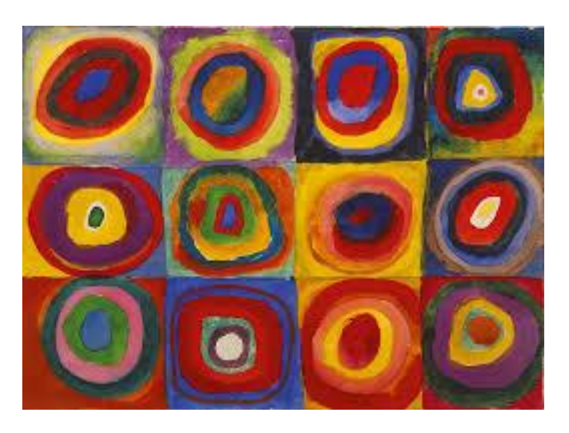
Russian artist Wassily Kandinsky – Squares with Concentric Circles - 1913

Grade: Kindergarten Lesson: "The Flower Garden"